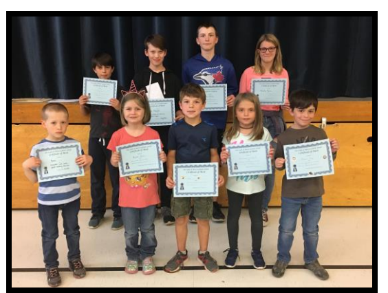
May Merit Award Winners!

Board Track and Field Meet Our Board Track & Field Meet will be held on Friday, June 14th. The Bus will be leaving OLM @ 7:30 a.m. and returning by 4:00 p.m. Please return forms ASAP!