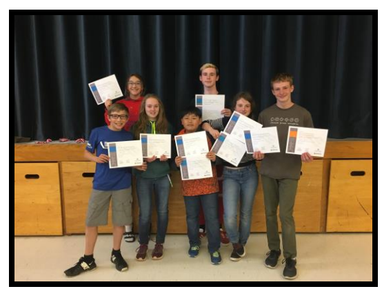
Gauss Math Contest Winners!